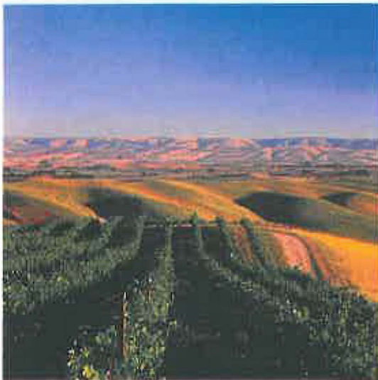
Below, from top: Woodward Canyon Winery's Cabernet Franc vineyard in Walla Walla; Willakenzie Estate, Willamette Valley. Opposite: Canoe Ridge Vineyard, Columbia Valley